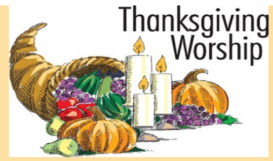
Sunday, November 19 10AM

have collected a non-perishable food item for the food pantry. Since the Pandemic, we have not had that feast. This year, we have the ability to provide fresh baked apple pies for those who use the food pantry. Typically, they are provided with a complete meal, but there is no dessert. Yes, we are collecting food items, but this would be a nice way to complete their Thanksgiving meal. Each pie would be $15.00; if you would like to participate in this mission, please place your donation of cash or check made out to CRCC with "Pies" in the memo in the collection box located on the back table in the sanctuary. Thank you for your support and making someone's tummy very happy.